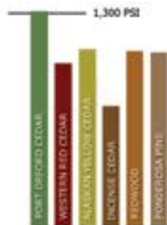
SHEARING STRENGTH (PARALLEL TO GRAIN)

Fiber stress at proportional limit in pounds per square inch.