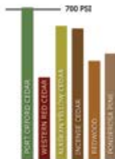
CRUSHING STRENGTH (PARALLEL TO GRAIN)

Maximum crushing strength in pounds per square inch.