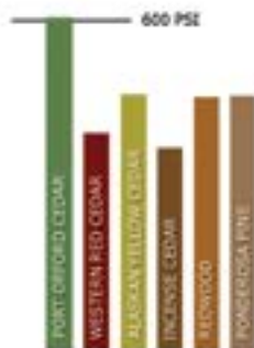
SIDE HARDNESS (PERPENDICULAR TO GRAIN)

Maximum shearing strength in pounds per square inch.